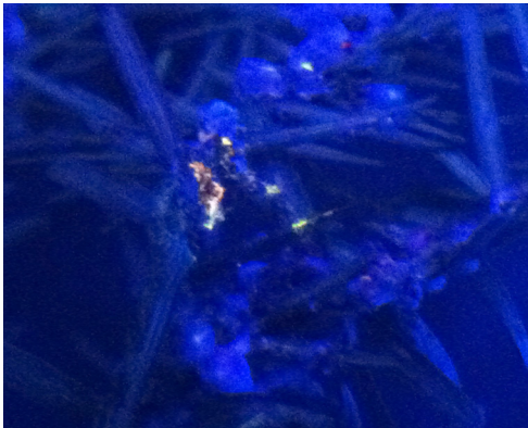
Fig. 4. Hemlock woolly adelgid ovisac damaged by L. nigrinus predation, glowing both yellow (egg damage) and orange ( L. nigrinus frass). In the background is an undisturbed ovisac glowing bright blue. Photo date: 23 April 2012.

We have been able to use this UV viewing technique alone in the field in the darkness, or UV light viewing under a dissecting scope to detect and illuminate predator