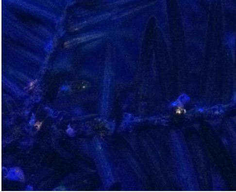
Fig. 3. Damaged Hemlock woolly adelgid eggs in a L. nigrinus -predated ovisac glow bright yellow (right); the predator frass to the left of the ovisac at the base of the twig is glowing orange. Photo date: 19 April 2012.

anthraquinones and have been the subject of extensive chemical investigation. The fluorescent properties of certain anthraquinones produced by aphids (known as aphins and aphinins) and other coccidae under UV light were first recognized by both German and British chemists, when pine bark adelgid was accidentally introduced into Great Britain from the USA during the 1930s and became commonly known as 'American Blight' (Duell et al. 1948, Nature 162: 759 - 761). Each of the aphin compounds shows a bathochromic spectral shift under UV-A light with increase in pH (Table 1). The UV fluorescence emission of these aphins simply runs through the visual spectrum from violet to red.