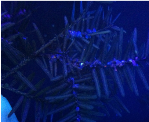
Fig. 1. An undisturbed hemlock woolly adelgid ovisac; the uric acid is glowing blue (center) surrounded by L. nigrinus -predated ovisacs, which glow an orange color.

orange), are present on hemlocks with predator activity, making previously invisible predator activity visible to the naked eye in the field and laboratory.